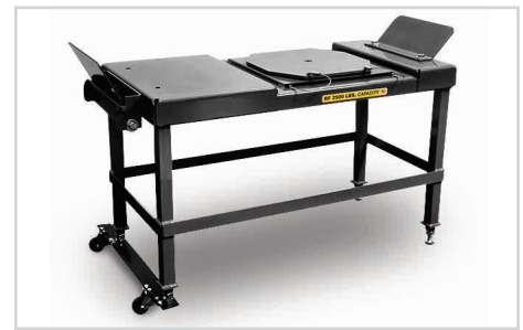
Alignment stand with set bridges for rolling compensation with built-in turnplates and slip plates.