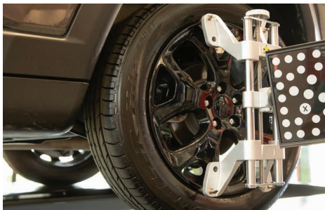
AC200 clamps (EAK0350J80A)