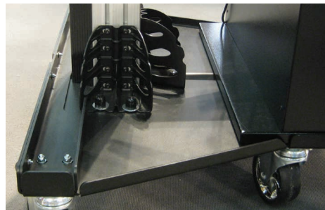
Relocate the equipment freely around the shop (EAK0320J78D)